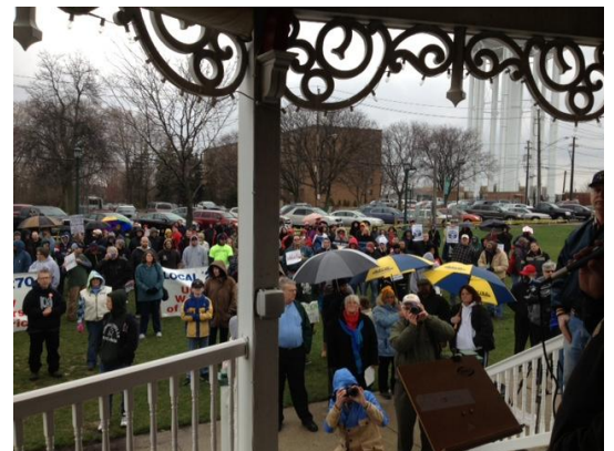
The rally was attended by many different Union organizations but only one other Teachers Association, the SHTA!