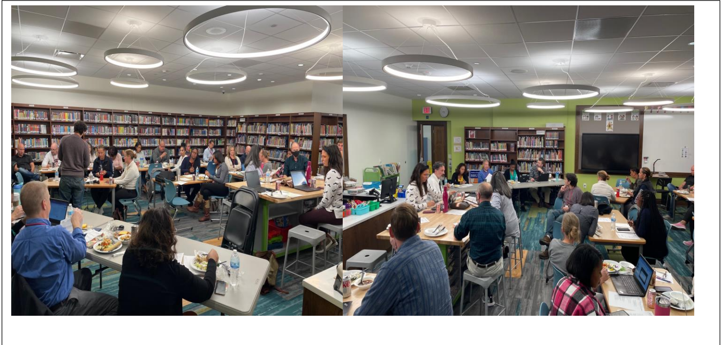
The October SHTA Representative Council Meeting at Fernway Elementary library.